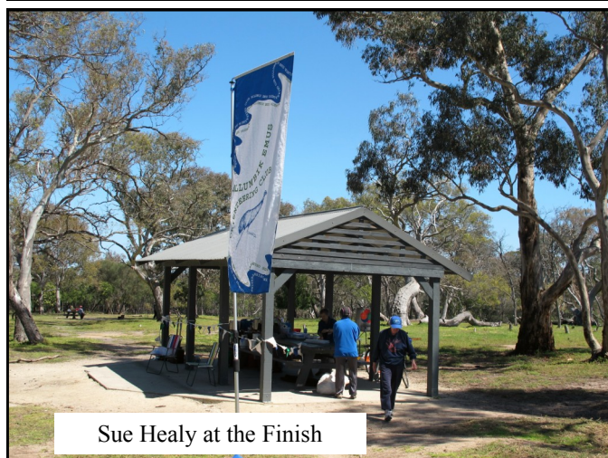
Sue Healy at the Finish