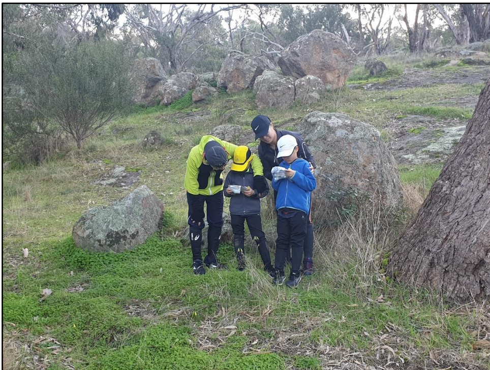
Darwin, Eofy, Virginia and Opus