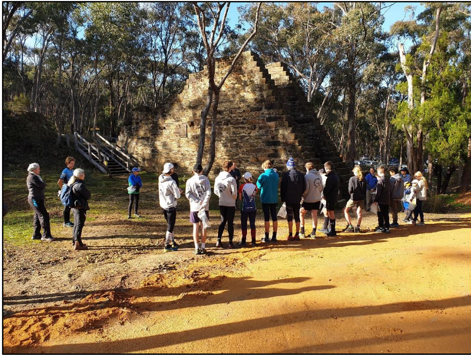
The Garfield Water Wheel

especially the younger ones getting to know and chat to the older juniors. Future relay training opportunities were highlighted as a point for development.